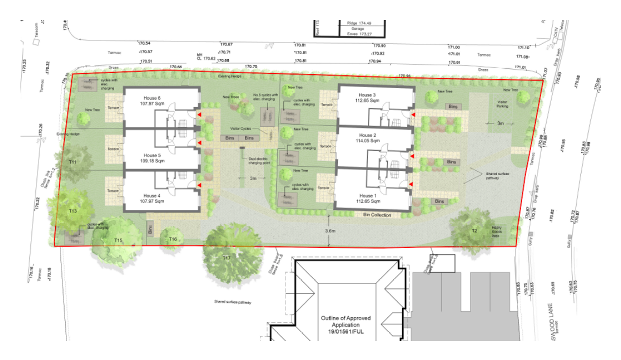
Fig 2: Proposed site layout