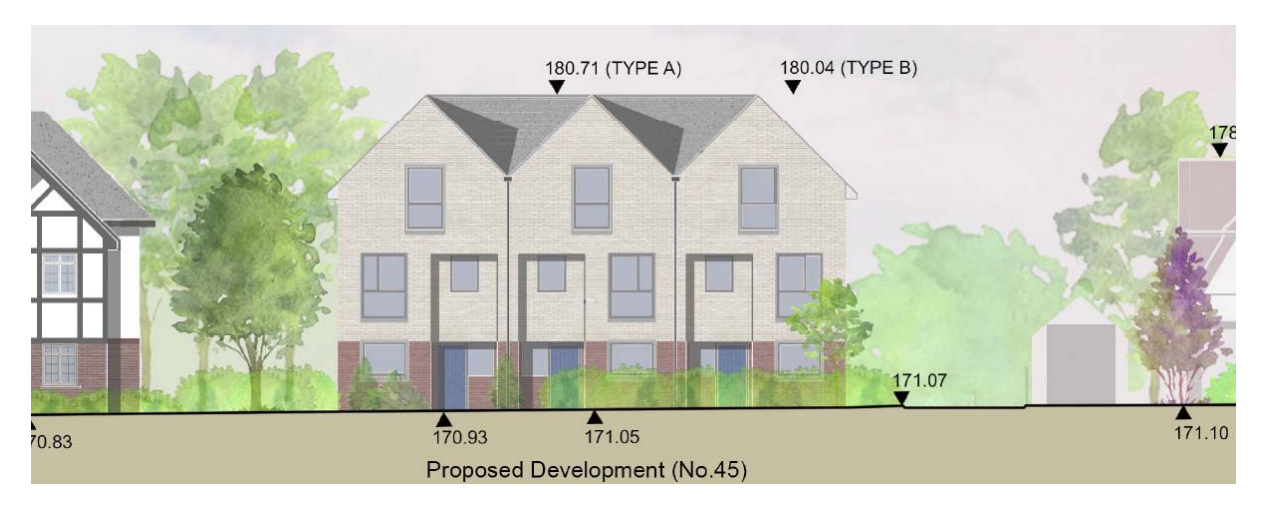
Fig 3: Elevational view highlighting the front of the proposal in relation to neighbouring properties.