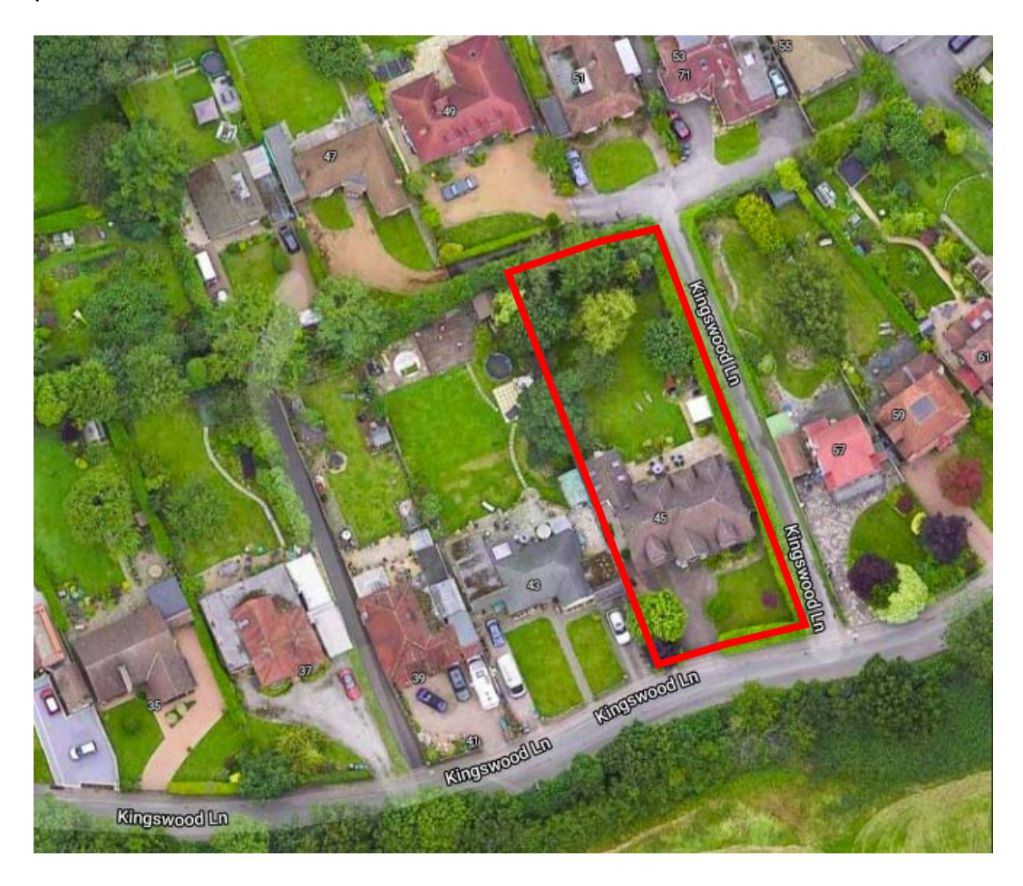
Fig 1: Aerial street view highlighting the proposed site within the surrounding street-scene